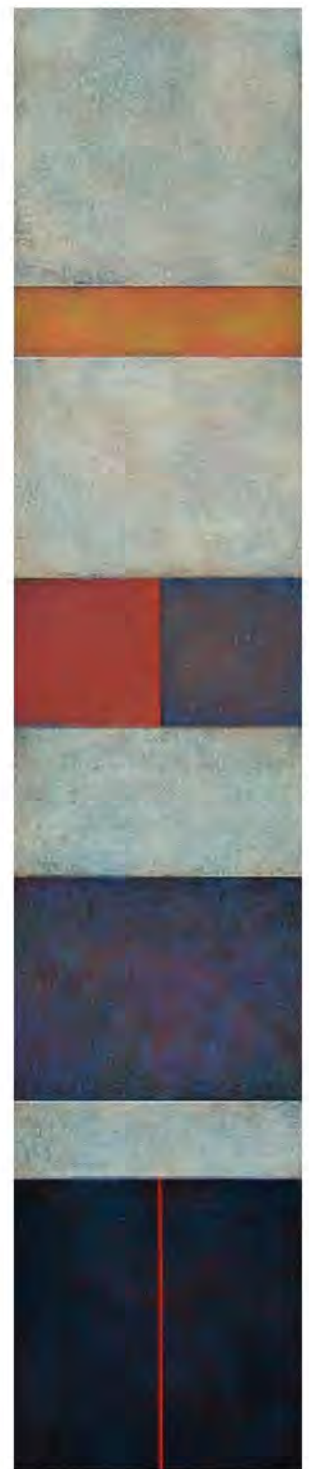
"Bar Series-Orange Square" 1976 Acrylic on board 60" x 12"