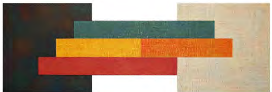
"Bar Series-Two Squares" 1976 Acrylic on jute - 14" x 15"